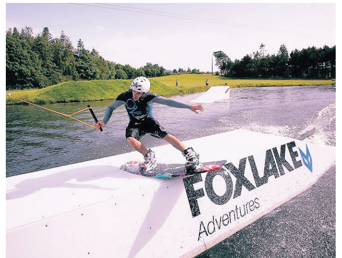
A WILD RIDE Enjoying the facilities at Foxlake Adventures

Grasping the basics of riding a wakeboard is fairly simple. An instructor can teach from the waterside and most people are up and riding the surface of the water within 10 minutes. Because you ride back and forth, it is easy to pick up tips and