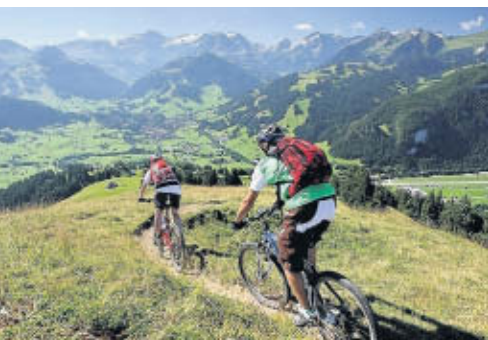
SCENIC ROUTE Taking in wonderful views