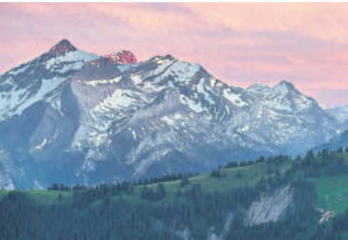
TAKE A PEAK Amazing Swiss Alps sunset